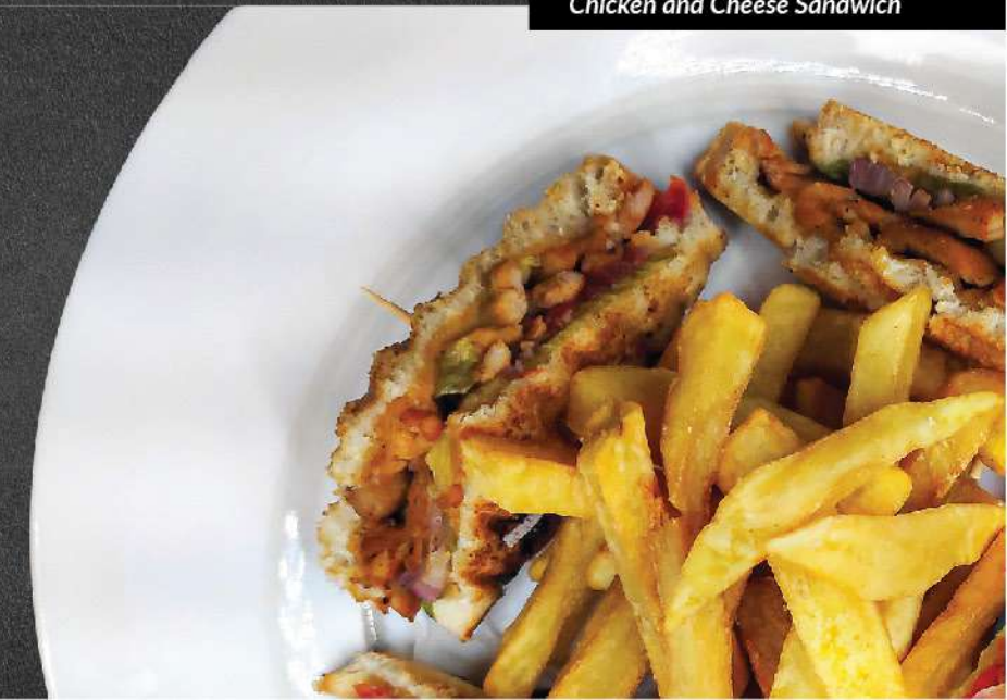
Chicken and Cheese Sandwich

A juicy chicken patty topped with melted cheese, served on a toasted bun.