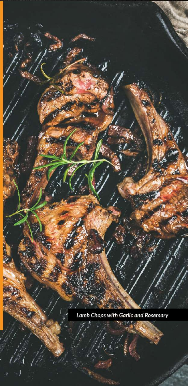
Lamb Chops with Garlic and Rosemary

Tender and juicy lamb chops, perfectly seasoned with garlic and rosemary.