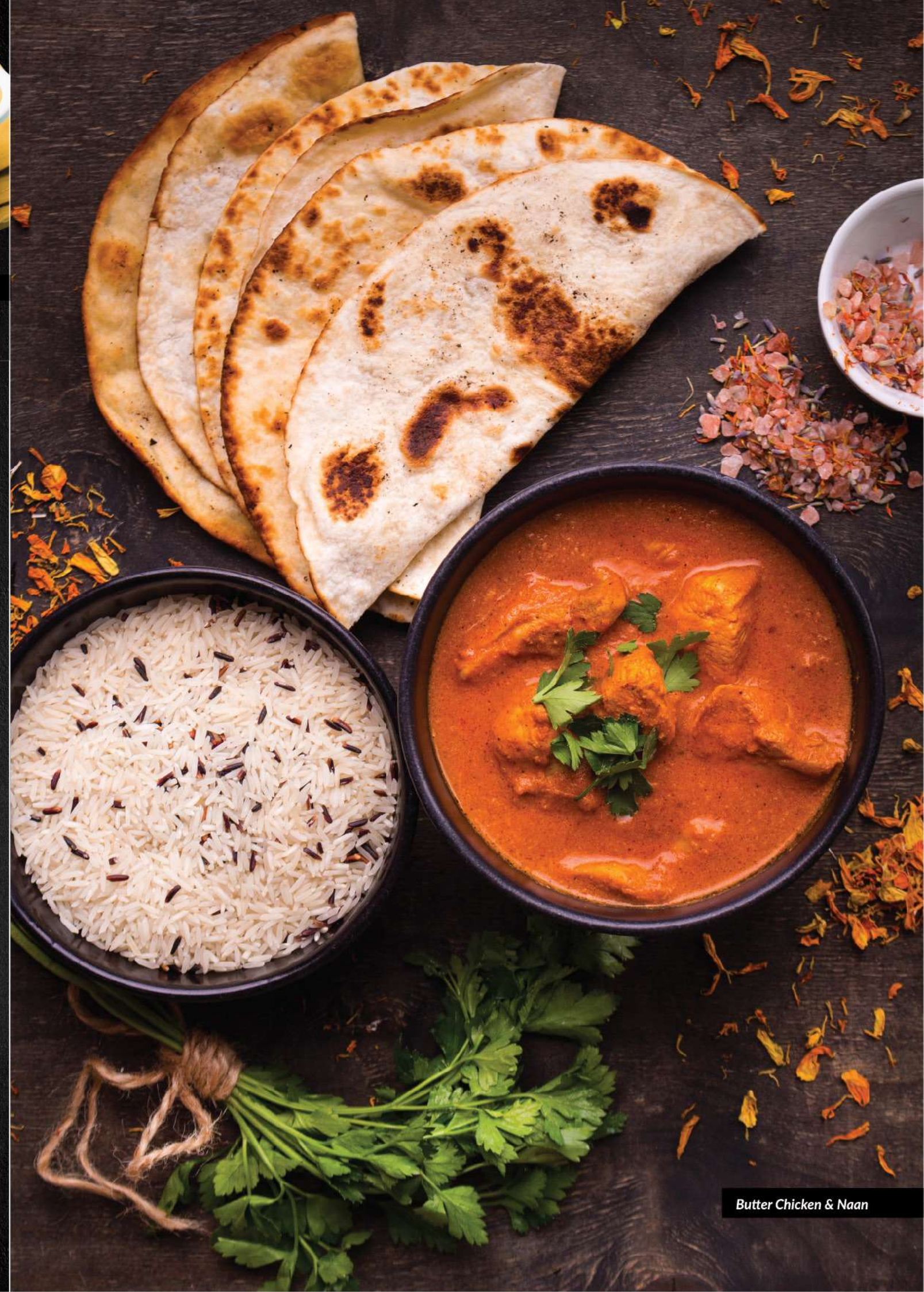
Butter Chicken & Naan

Authentic Thai curry made from natural roots, herbs, vegetables infused with coconut milk.