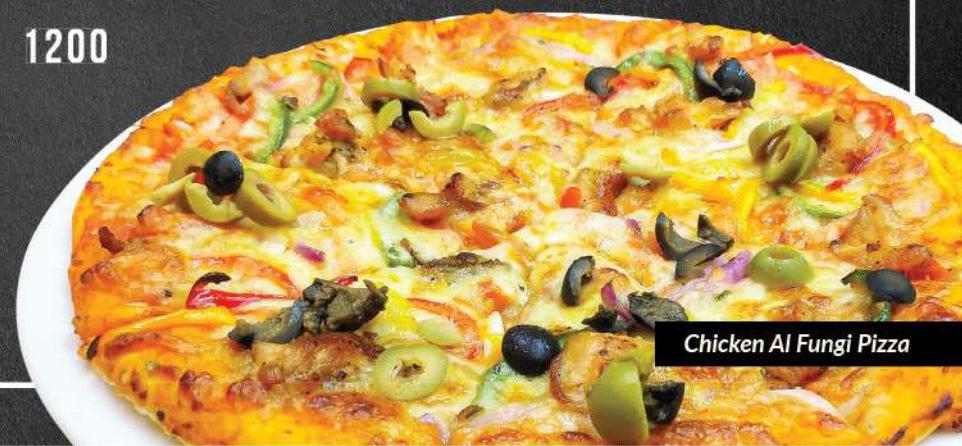
Chicken Al Fungi Pizza

With mushroom, carrots, zucchini, bell pepper, olives topped with cheese.