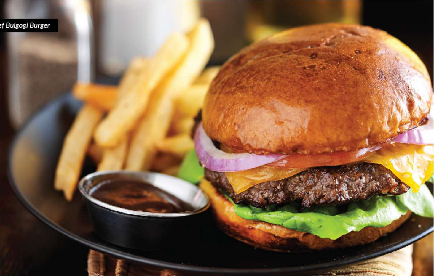
Beef Bulgogi Burger