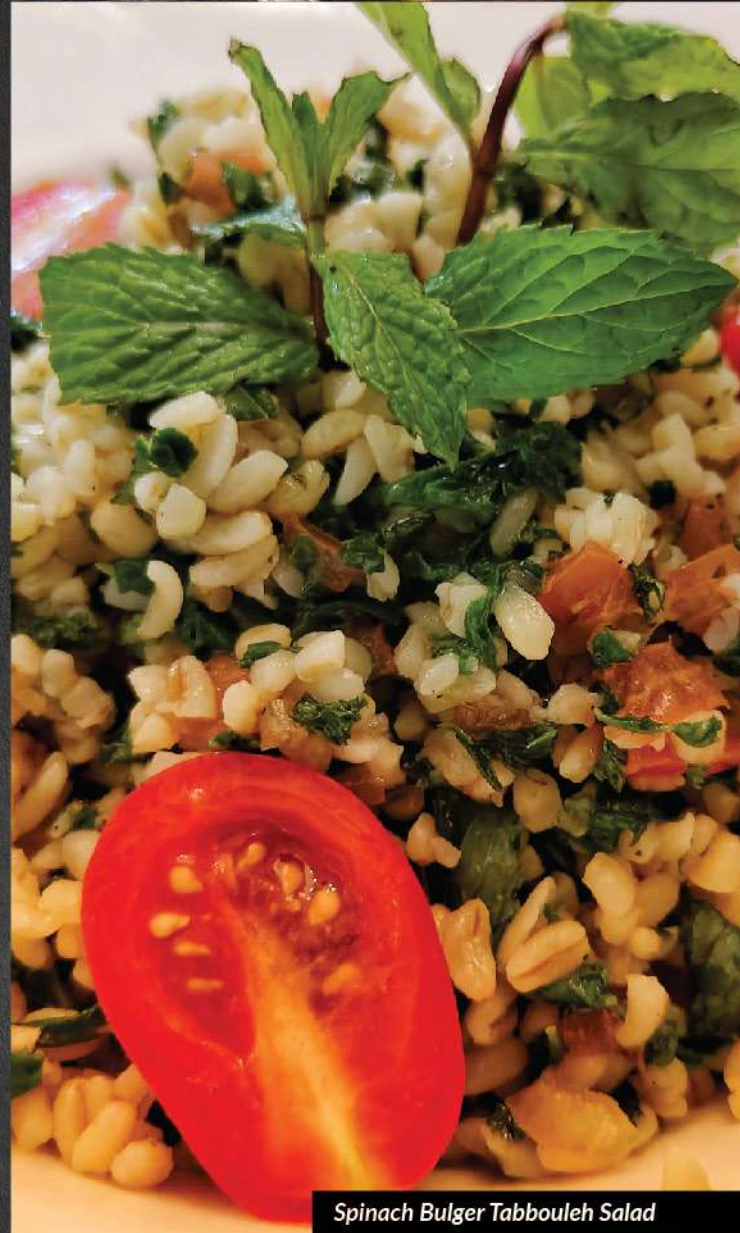
Spinach Bulger Tabbouleh Salad

Grilled chicken breast using Cajun spices served, with lettuce, shredded carrots, scallions and cilantro.