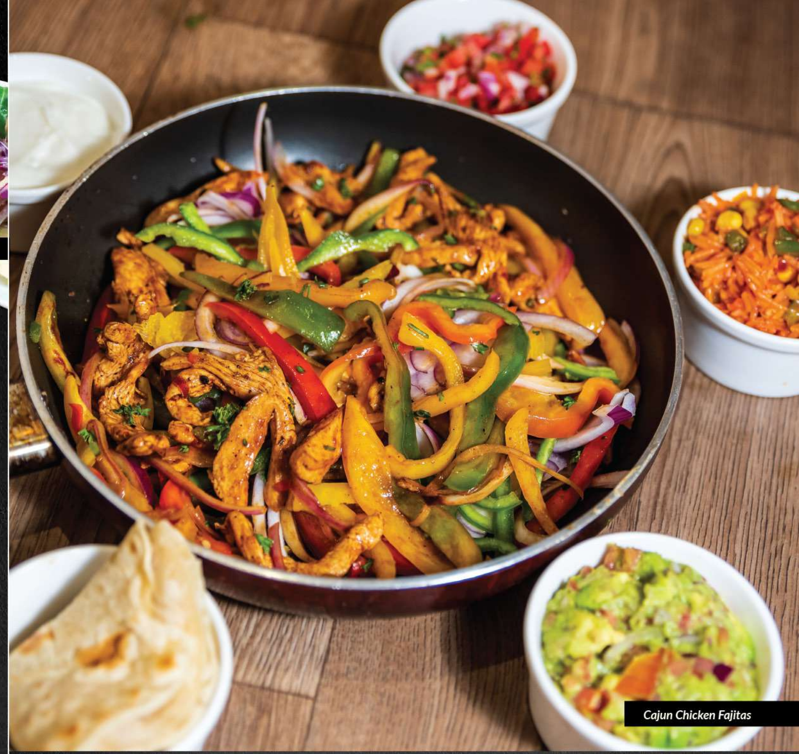
Cajun Chicken Fajitas

VEG FAJITAS 800 Sautéed peppers, onions, zucchini, Cherry tomatoes and mushrooms.