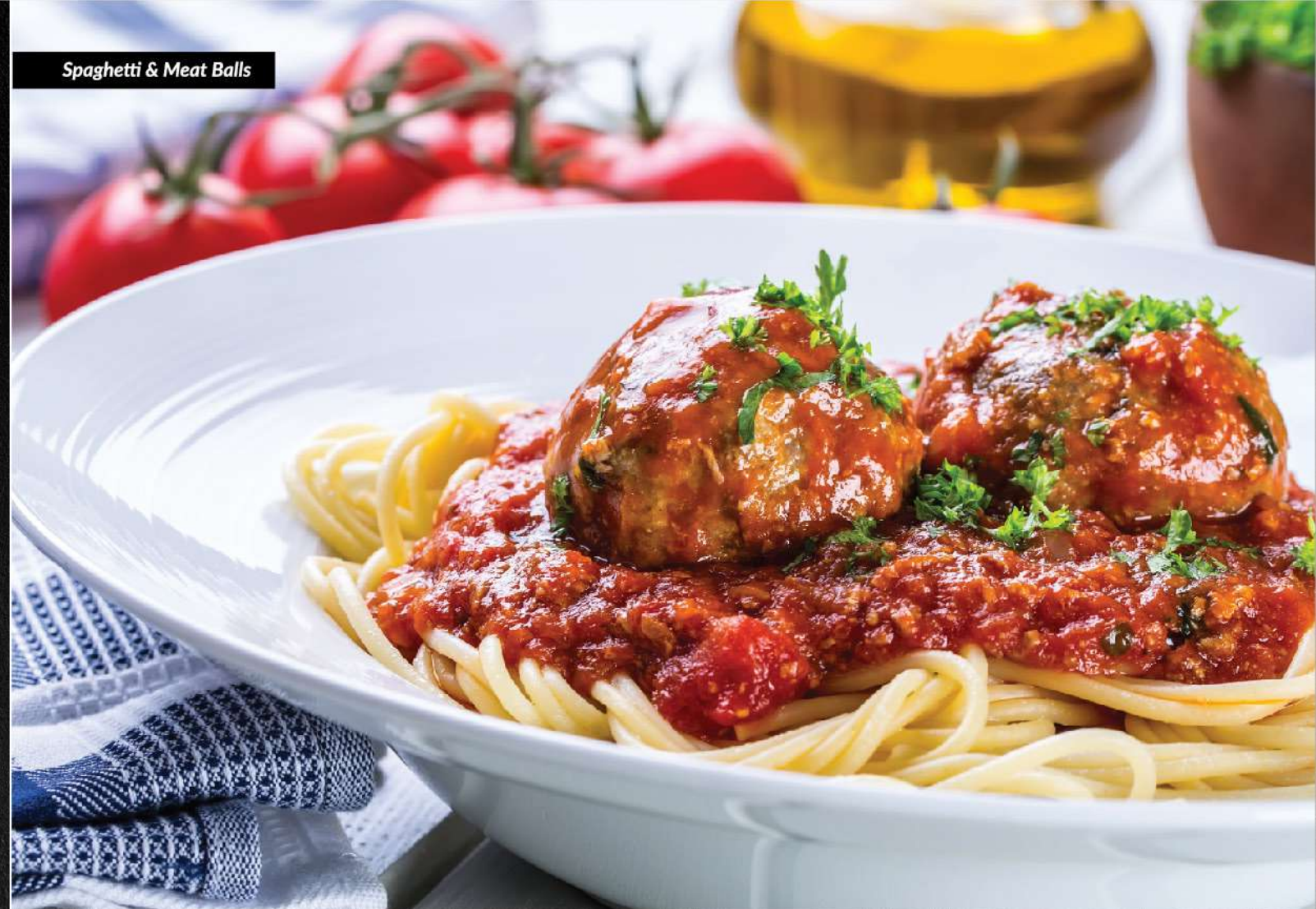
Spaghetti & Meat Balls

Crispy golden brown fish fingers served with a side of crispy, salty fries.